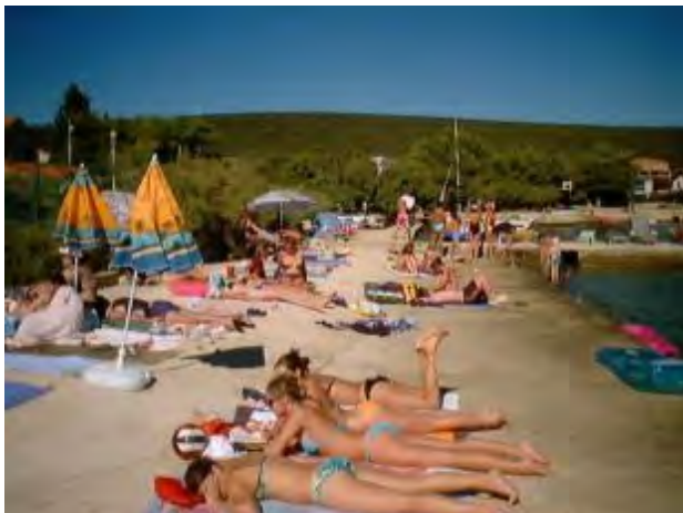
About the surrounding of the accommodation unit

Distance from the bus stop is 200 m Distance from the railway station is 11 km (Zadar) Distance from the nearest airport is 10 km (Zemunik) Distance from the nearest ferry port is 13 km (Zadar) Distance from the pharmacy is 1800 m Distance from the medical institution is 1500 m Distance from the nearest exchange office is 1450 m Distance from the town centre is 1500 m Distance from a grocery store is 200 m Distance from the nearest gas station is 4 km Distance from the sea is 150 m Walking distance to nearest beach is 250 m Type of beach: sandy and pebble Accessibility to accommodation by car: excellent Enough parking space in shade